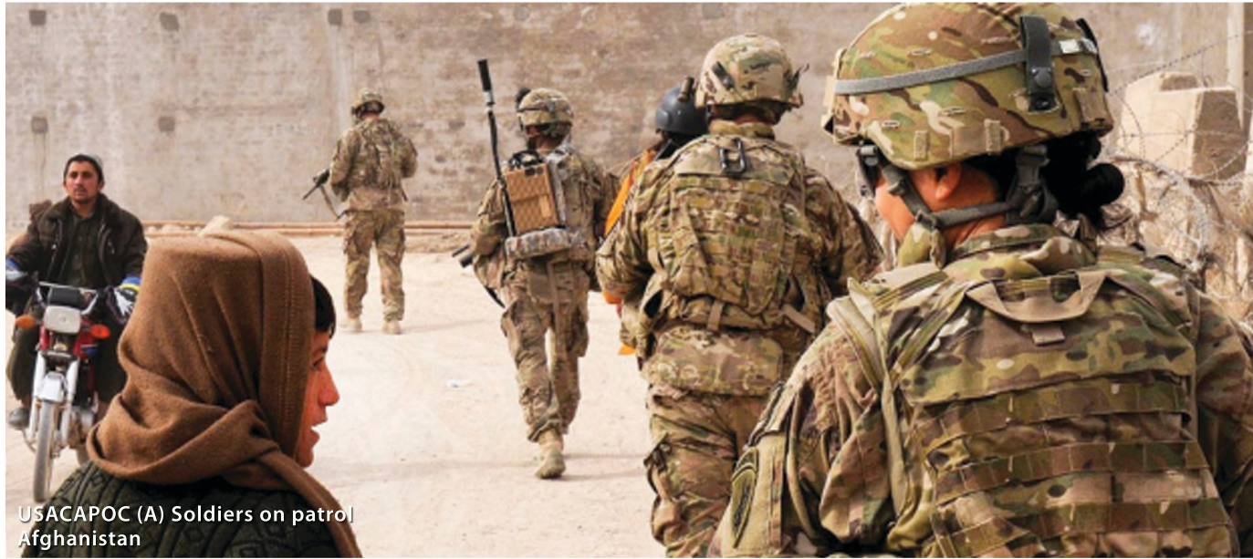
USACAPOC (A) Soldiers on patrol Afghanistan

Psychological Operations Specialist (37F) Army Reserve Psychological Operations Specialists are experts at persuasion and influence. They specialize in the planning, analysis, development, design, dissemination, and evaluation of PSYOP across the competition continuum.